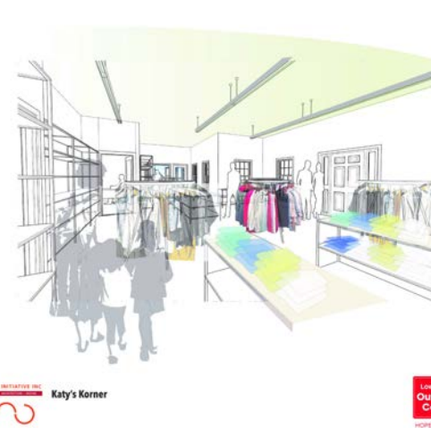
Rendering of Completed Space